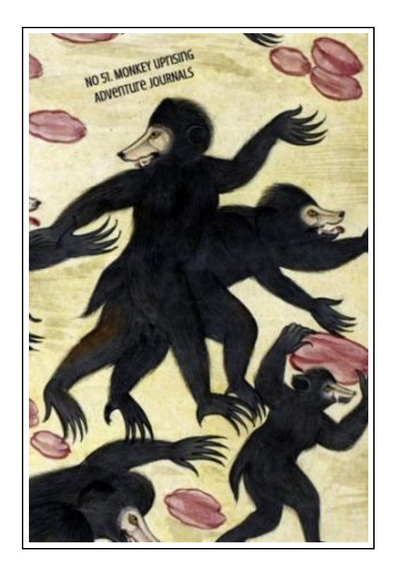
Filesize: 2.65 MB