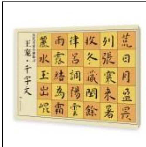
Filesize: 3.12 MB